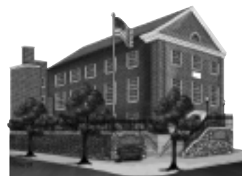
See article on Page 4

(If you would like, just attach the mailing label from your newsletter below)